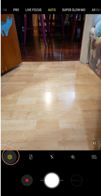
Step 1: Open the camera and click on settings

Follow the the steps below to set up your camera for filming.